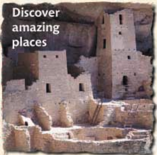
Explore the Ancient Southwest

Explore the Ancient Southwest, America's Original Promise, California's Channel Islands and Backcountry, GIS Mapping or The Global Garden