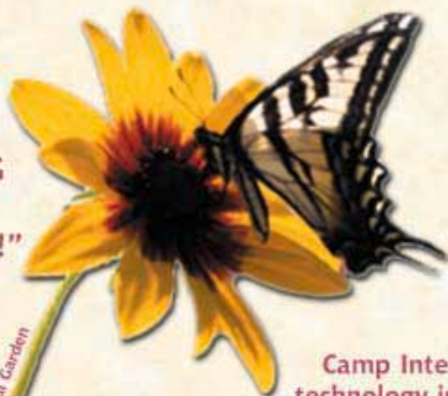
Explore the Global Garden

Take our Virtual Tour Online www.campinternet.net/intro